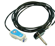
Bovie EZ Link Remote Activation Switch (SERS2)