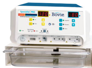
ESMS-C Electrosurgical Mobile Stand with Smoke Shark ™ System (SE02)