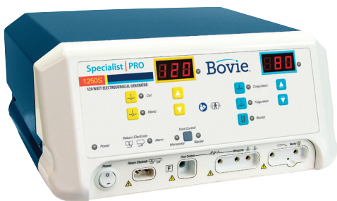
Bovie 1250S-V Electro-surgical Generator

The Bovie 1250S-V, Specialist | PRO, 120 watt electro-surgery generator combined with the Smoke Shark ™ II smoke evacuator provides a complete and precise energy system with safe and effective smoke particle capture capabilities. Surgical smoke is a by-product of electro-surgery and can carry viruses, CO and other chemical and biological hazards.