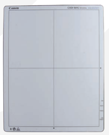
11"x14" Canon CXDI-801C Cesium Wireless Panel