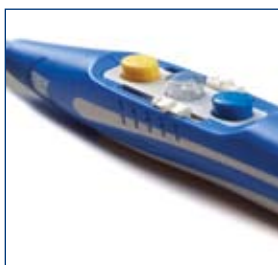
Force Triverse™ Pencil