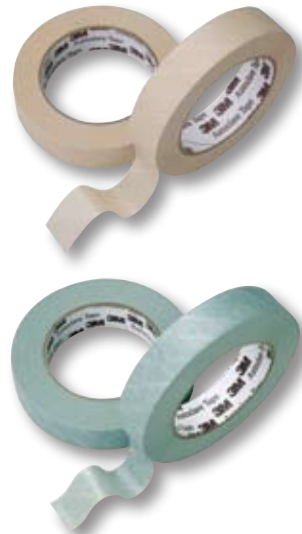
3M™ Comply™ 1222 (tan) and 1255 (blue) Indicator Tapes for Steam

3M™ Comply™ Indicator Tapes for steam sterilization are reliable process indicators. The chemical indicator stripe on 3M™ Comply™ 1255 indicator tape will turn light to dark for easy identification when exposed to a steam sterilization oxide process. These products are simple to apply and the reliable high tack adhesive adheres well to packaging material. 3M™ tape dispensers models C22 and M920 provide convenient dispensing of 3M™ Indicator Tapes.