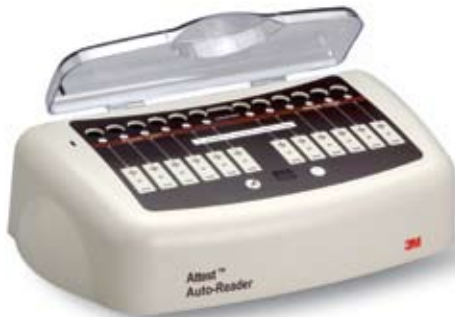
3M™ Attest™ 290 Auto-reader – 12-well capacity

Attest Auto-readers incubate at 60^{\circ}\text{C} \pm 2^{\circ}\text{C} ( 140^{\circ}\text{F} \pm 3^{\circ}\text{F} ) and automatically read the fluorescence produced by the 3M Attest 1292-S Rapid Readout biological indicators. The Attest Auto-reader will hold the result until recorded and may help streamline your processes. The Auto-reader is also designed to allow continued incubation to verify the test organism's outgrowth.